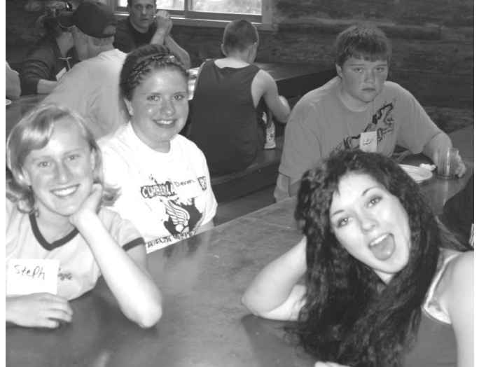
Some of our happy campers at Trails End Camp.